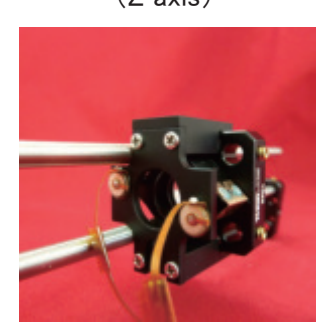
Stroke: \pm 1.5 mm