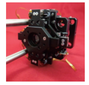
Stroke: \pm 1mm

Resolution: 0.1 \mu m, 0.5 \mu m, 1.0 \mu m, 5.0 \mu m/pulse (Selectable) Repeatability: ±3pulses