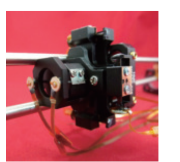
\begin{array}{l} XY-Stroke:\pm 1mm\\ Z-Stroke:\pm 1.5mm \end{array}