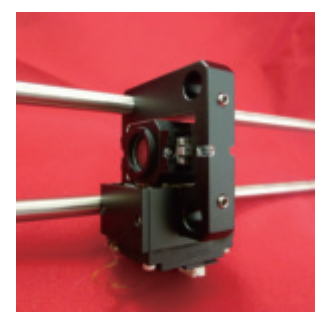
Stroke: \pm 1.5 mm